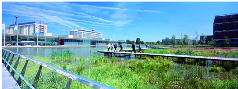
Philips High Tech Campus in Eindhoven where the interviews were held

Capgemini provided consultancy services to Philips to initiate and manage the project. After initial review, they decided to recommend The Open Group Certified IT Specialist (Open CITS) program as a framework to follow. The reason for choosing this certification program as part of the Competence Development framework for Philips was that it was already a vendor-neutral, application-independent program that was globally recognized.